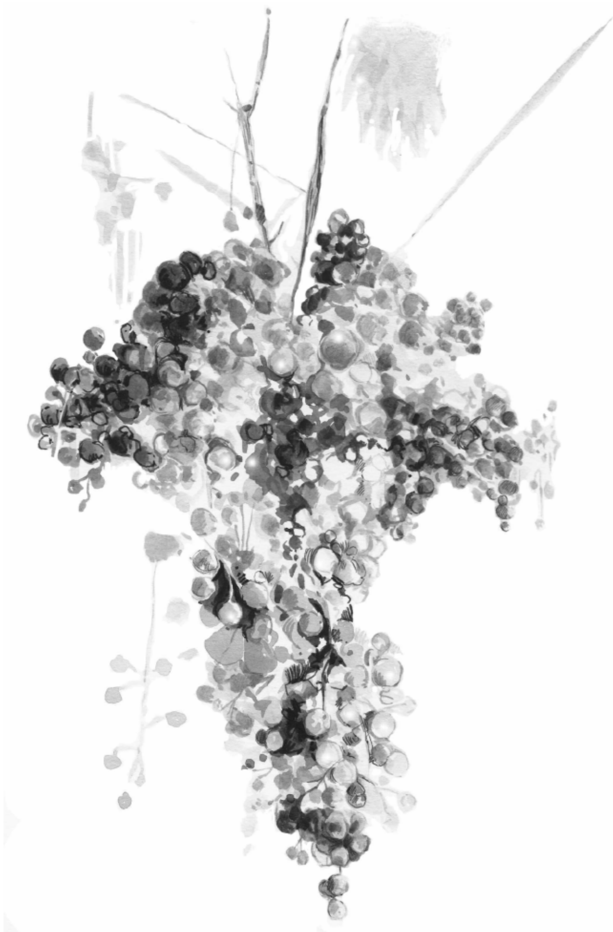
Illustration by Ella Walker ©