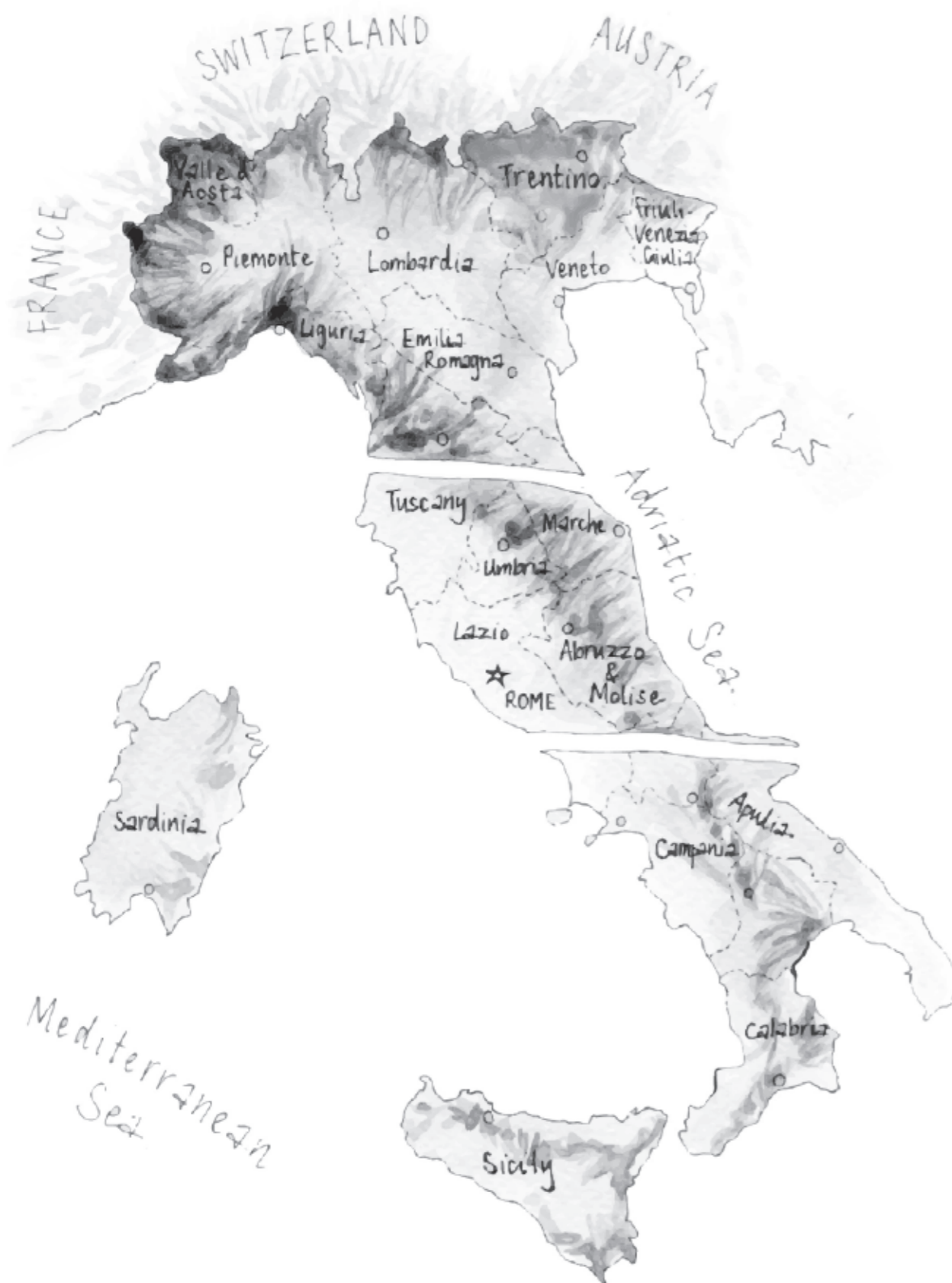
Illustration by Ella Walker ©