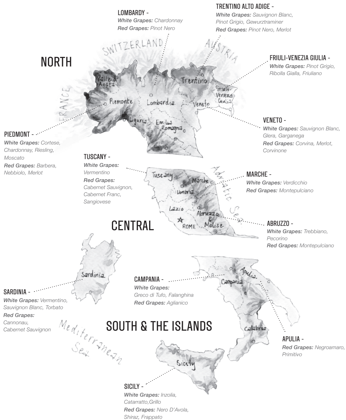
Illustration by Ella Walker ©